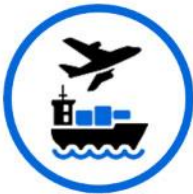
IMPORTING & EXPORTING

To learn more about our Amazon Seller solutions, please visit us online at www.logisticsplus.com/Amazon or send an email to our Amazon retailer and seller support team at amazonretailer@logisticsplus.com .