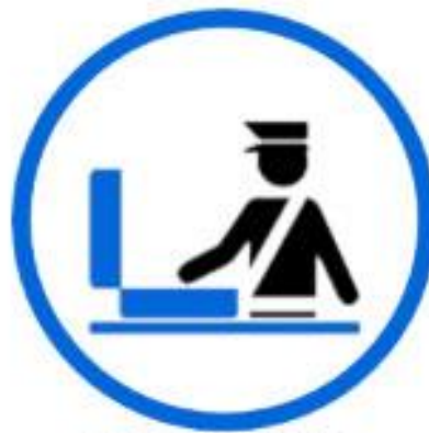
TAXES & TRADE COMPLIANCE