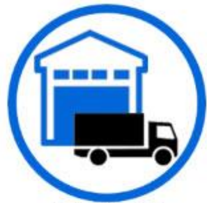
WAREHOUSING & FULFILLMENT