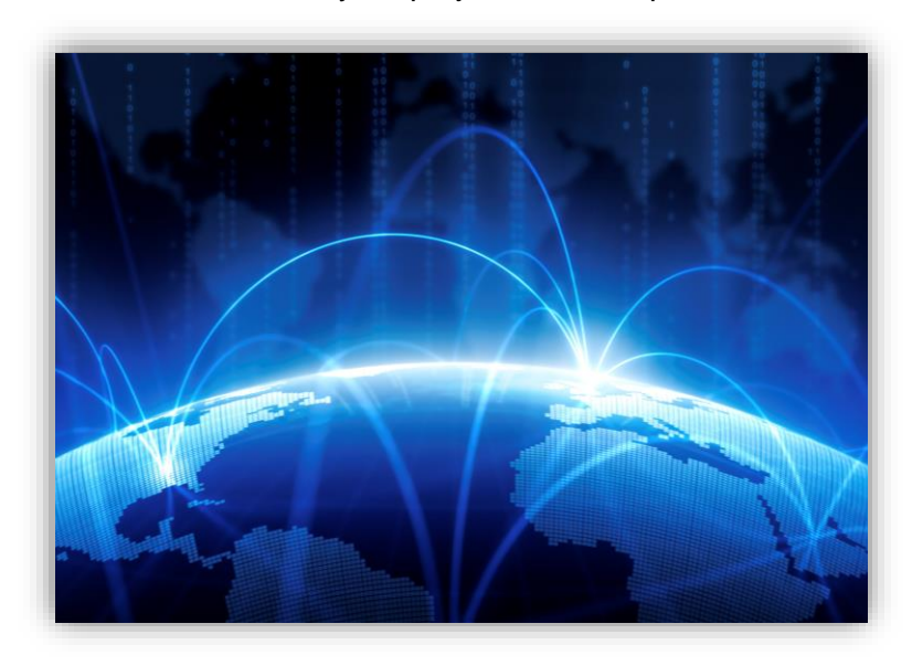
Complete Logistics Management

Our licensed consultants will remove the IOR and EOR complexities and work directly with manufacturers to ensure accurate product datasheets and certificates are obtained to ensure your projects are completed on time.